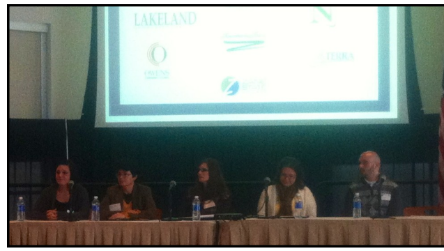
(Above) — AmeriCorps College Completion Coaches Discuss Their Experiences.

Also, another symposium is planned for the spring with topics and details still to be determined.