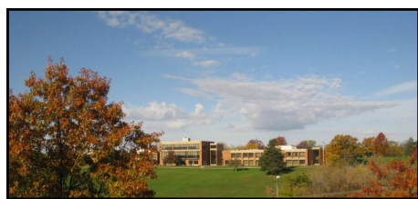
EGCC's main campus in Steubenville

The new Valley Center site rests in the heart of downtown Youngstown. Renovation work continues on the space that includes classrooms, high tech labs, a math emporium, information commons, student commons, and student services offices. Classes began in the new space this fall, moving from a nearby career center.