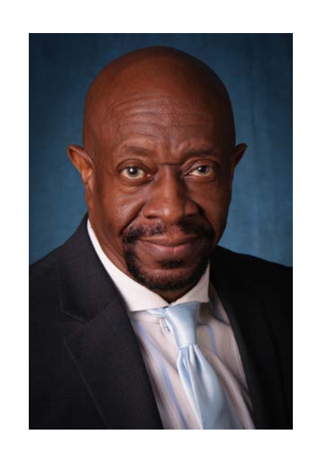
February 7, 2020