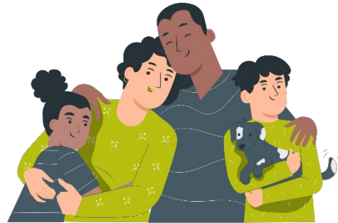
External Obligations (work/family)